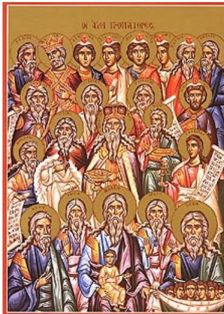
Sunday of the Forefathers